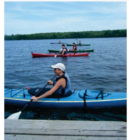
Lining up for kayak race in Regatta