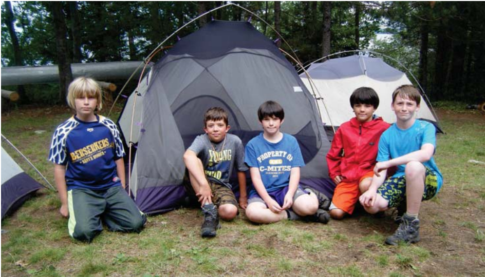
De-tripping after Saddleback trip