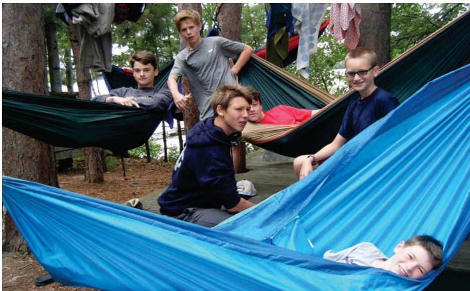
Hamming it up during rest hour outside the Kopa