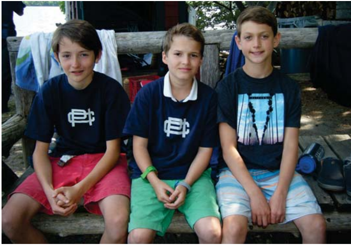
Waiting for their race at our annual Regatta