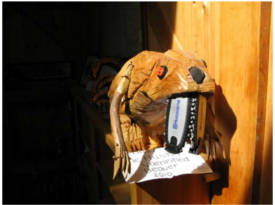
Buzz, the Husky Varnished Beaver

At the end of the summer, there is a Sacred Ceremony where we actually receive the animal. I have been to two Sacred Ceremonies. Each one was different. At both Sacred Ceremonies I have seen, we have received animals. In 2009